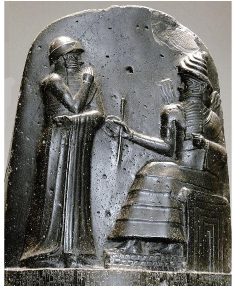
Relief of Hammurabi and the god Shamash